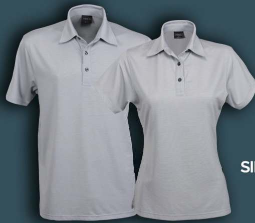
SILVERTECH POLO 1058 / 1158